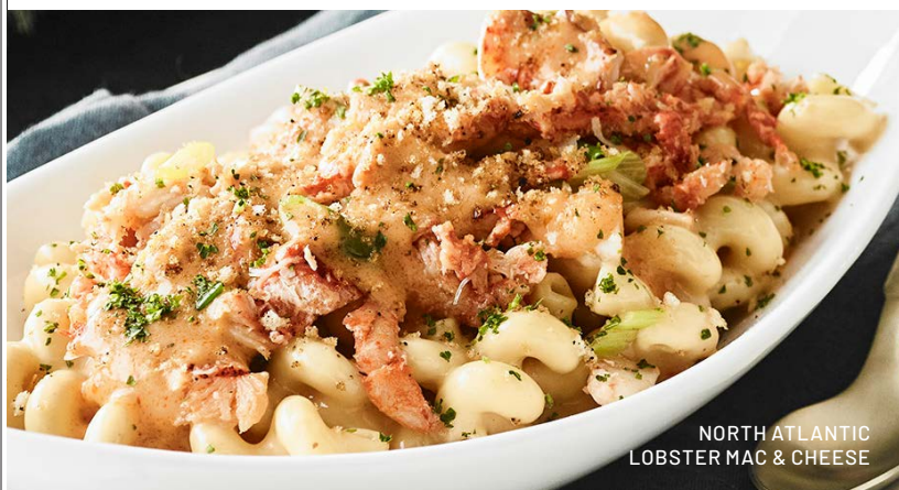
NORTH ATLANTIC LOBSTER MAC & CHEESE

tender lobster, cavatappi, smoked cheddar, chipotle panko breadcrumbs 1310 cal