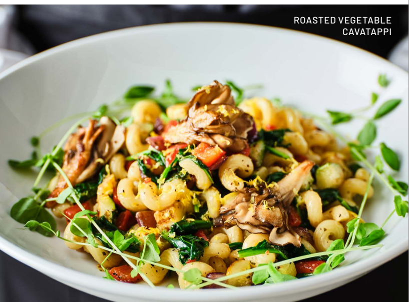
ROASTED VEGETABLE CAVATAPPI

roasted red bell pepper, cauliflower, red onion & maitake mushrooms, asparagus, sautéed spinach, herb olive oil, pea shoot tendrils 755 cal