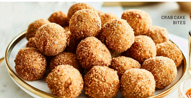
CRAB CAKE BITES