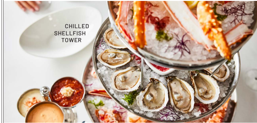
CHILLED SHELLFISH TOWER