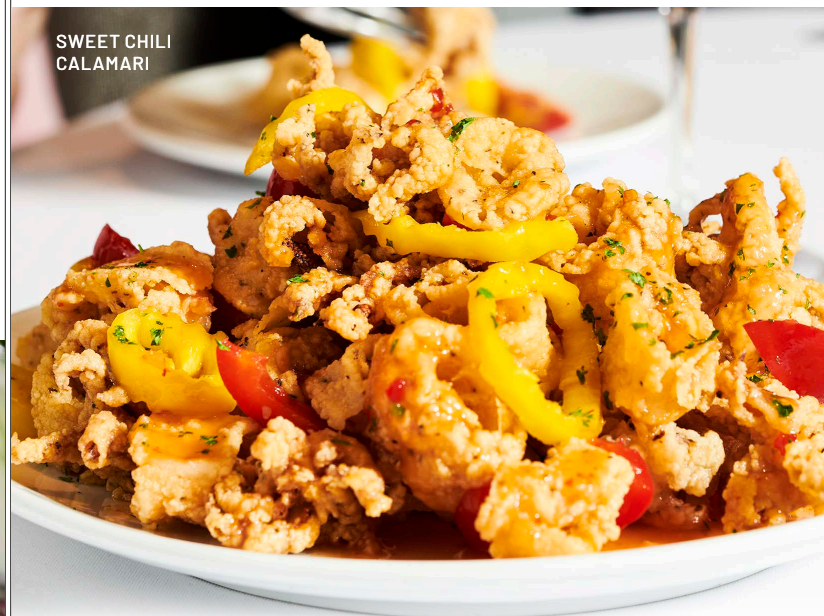
SWEET CHILI CALAMARI