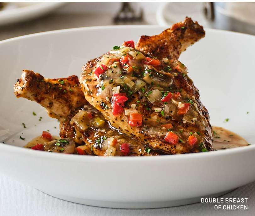
DOUBLE BREAST OF CHICKEN

crispy potato marrow with chimichurri & farro, asparagus and pickled onions with mushroom demi-glaze 1060 cal