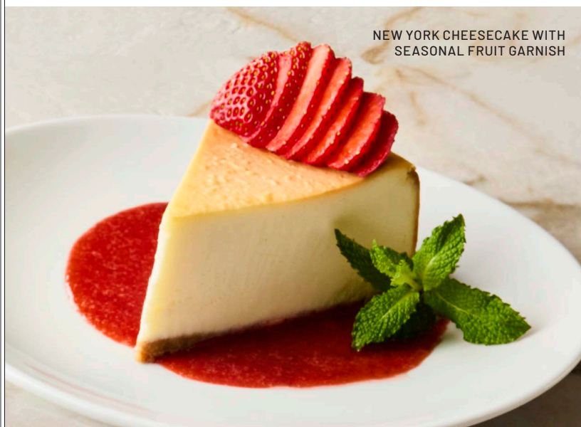
NEW YORK CHEESECAKE WITH SEASONAL FRUIT GARNISH