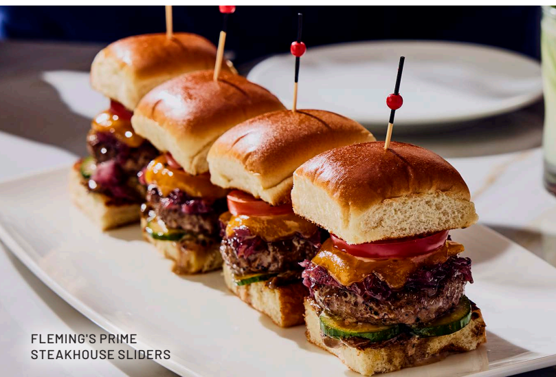
FLEMING'S PRIME STEAKHOUSE SLIDERS

featuring carrot cake, chocolate dipped strawberries, orange chocolate truffles 1970 cal | 30