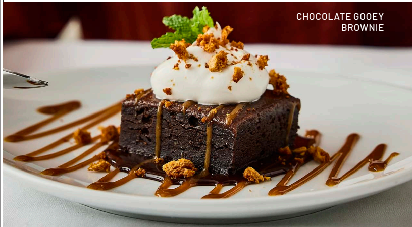
CHOCOLATE GOOEY BROWNIE